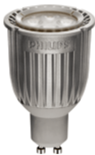
MASTER LEDspotMV GU10 MASTER LEDspotMV GU10